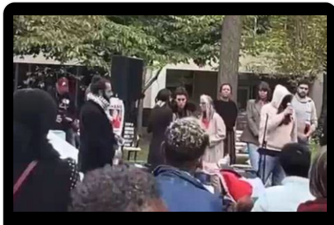
Anti-Israel speech on campus Video screenshot